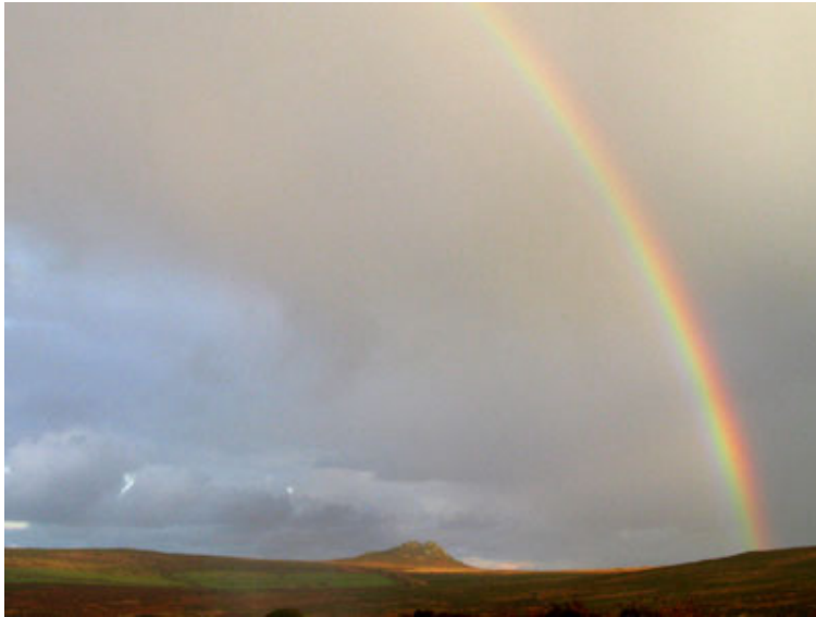
Rainbow over Carn Gulva

Please e-mail us for future dates. Tours can also be customised to meet your own requirements.