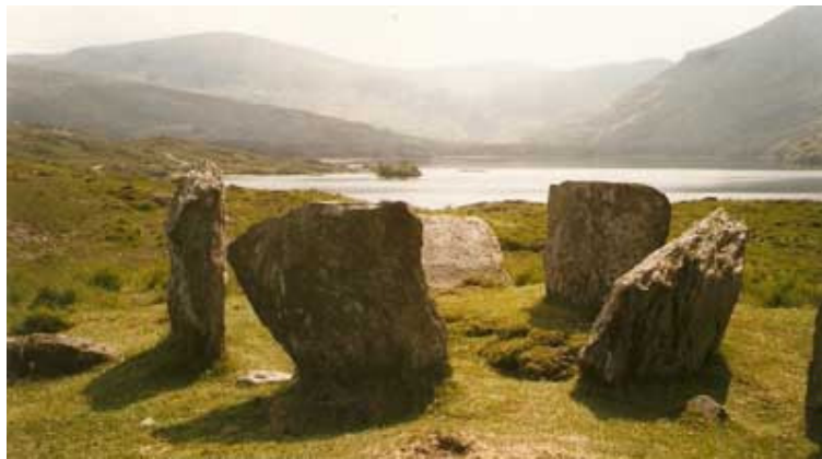
Uragh circle, Beara

As we shall be a small Group, it means that we can try and look after your individual needs as much as possible. The magic of the sites should speak for themselves, but we are also very happy to share our knowledge and love of these places and their meanings with the Group, and to spend time getting to know you and ensuring that you have a deeply fulfilling and nurturing time.