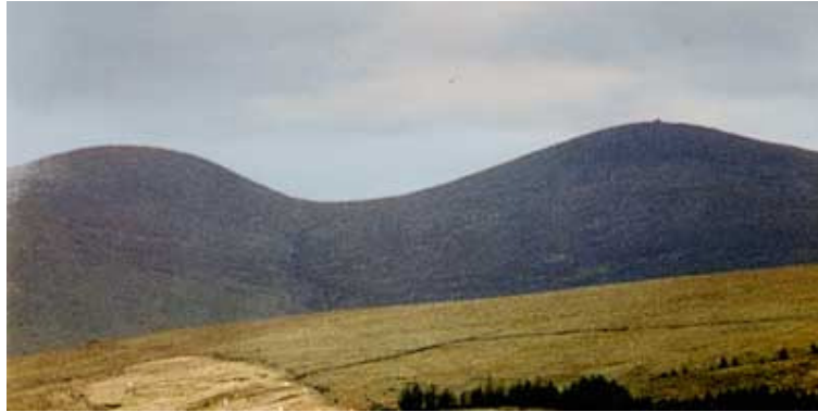
Paps of Anu