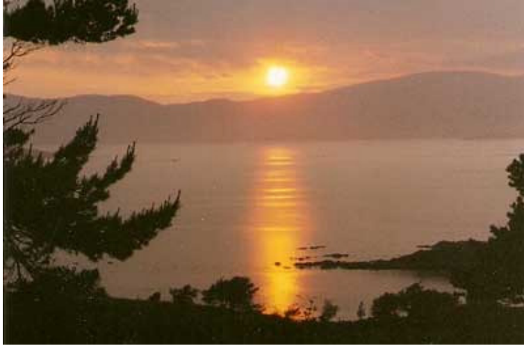
Sunset over Beara