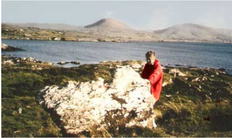
Cailleach Beahra stone

Along the way, we visit a mermaid Sheela-na-Gig at Clonfert Abbey and a beautiful stone circle by a lake at Lough Gur that is overlooked by a holy hill where the Goddess Aine was celebrated up until recent times. Then we catch a glimpse of the magnificent Paps of Anu , named after the eponymous Goddess of all Ireland, before calling in to see St.Gobnait's Sheela-na-gig at Ballyourney . Then we head to the furthest west peninsula of Beara , named after the Cailleach Beahra, a rugged unspoilt area with many stone circles and a boulder stone said to represent the Cailleach Beahra herself.