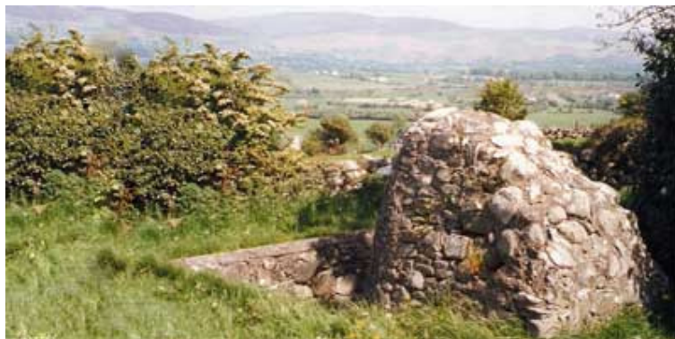
Bridget's Well, Faughert