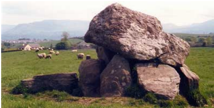
Carrowmore dolmen, Maeve's Lump

There will be plenty of time to connect with the sites and the spirituality of the landscape, and there will also be opportunity to reach out to the Goddesses at the sites. Join us now for a magical mystical tour of the sacred island of Ireland.